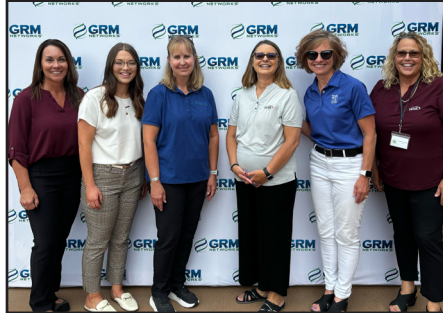
Pictured above are employees representing Smart Rural Community Providers at Fiber Field Day.